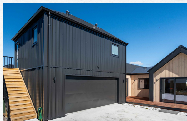
AFTER AN AIRBNB? 44sqm - 1 bed unit

Main home (ground floor) 214 m 2 Unit - 44m 2 (over garage)