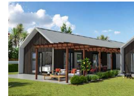
Pauanui Green, Pauanui GHNZ Coromandel Development