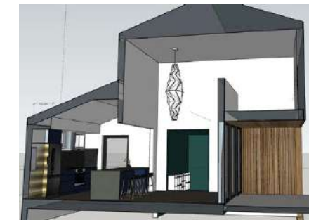
Avondale, Auckland Infill project