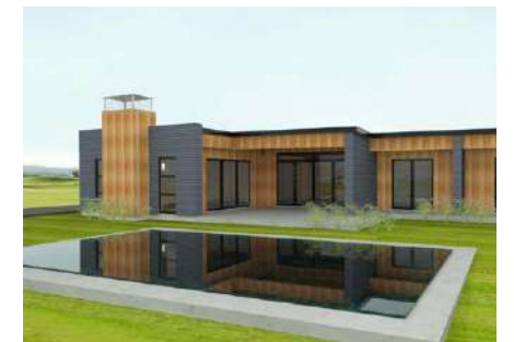
Pegasus concept, Christchurch