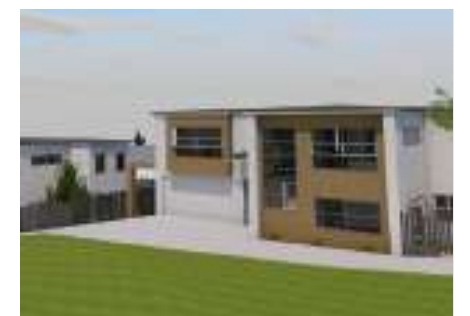
Ireland Road, Auckland Infill project