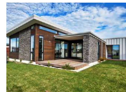
Lincoln, Christchurch Showhome

These are just for starters. Golden Sands in Tauranga, Scotts Point in Hobsonville, New Zealand premier Homestar Development at Matakana Green, or urban infill projects in Auckland.