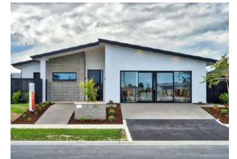
Rolleston, Christchurch Showhome