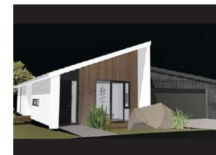
Swanson Birdwood Heights Development