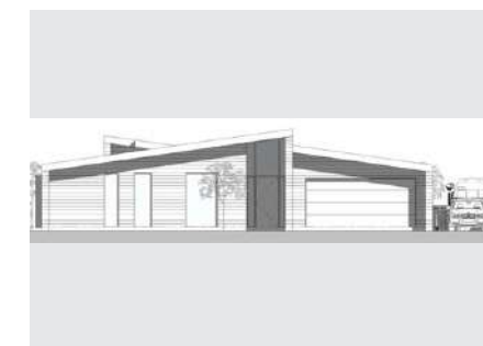
Matakana Green, Matakana Involvement in NZ's first 7 Star Homestar Rated Development